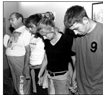
Alexandria, VA

None of our work is possible without the generosity of our deanery community and the community-at-large. Individuals, parishes, and business partners have all helped us provide help and create hope in many lives.